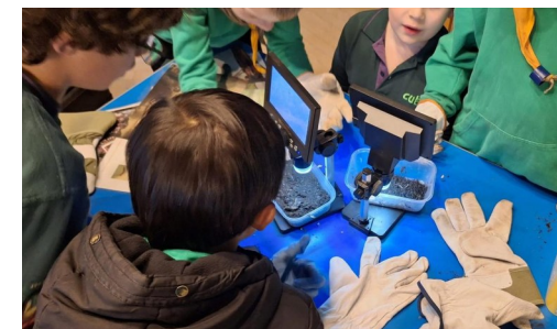
The scouts using microscopes to looking at mine-beasts!

We have, with lots of community help, built a dead hedge and bug hotels to encourage more wildlife. Many thanks to Barclaycard volunteers, St Benedict's Guiding Groups & 49th Northampton Scouting group.