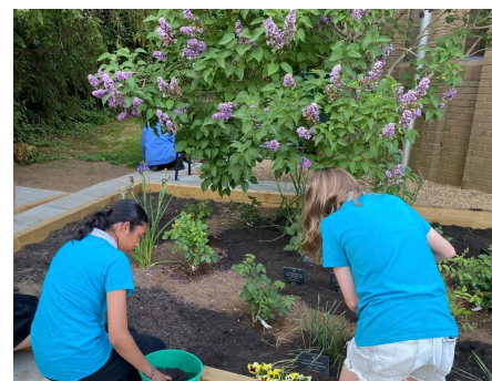
Our Girl Guides maintaining the memorial garden